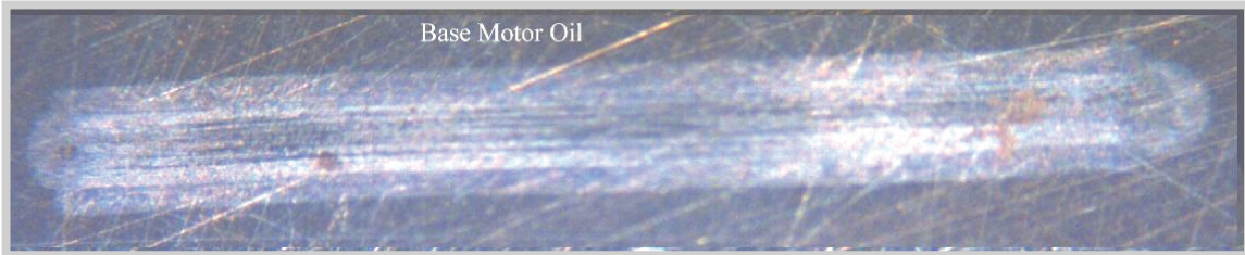
Figure 2. Image of the wear scar on disk for SRV Test No. 1. The mirror finish and the removal of the surface features of the disk, i.e. the deep etching marks, are evidence of polishing wear.